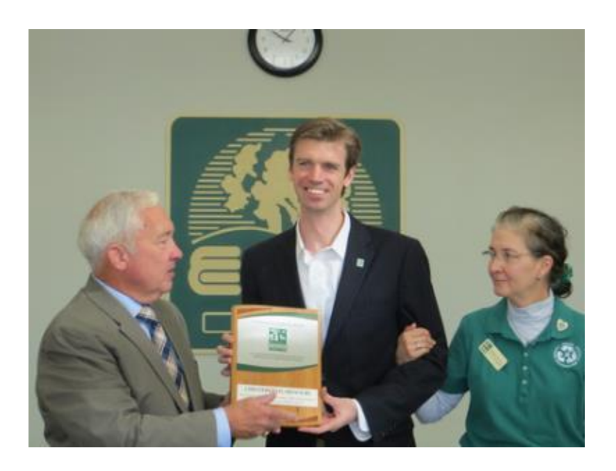
In 2014, Collin O'Mara, NWF President and CEO pronounced Chesterfield as LEADER IN COMMUNITY ACTION ADDRESSING WILDLIFE HABITAT LOSS

CCE acts in an advisory capacity to the City Council of Chesterfield, MO